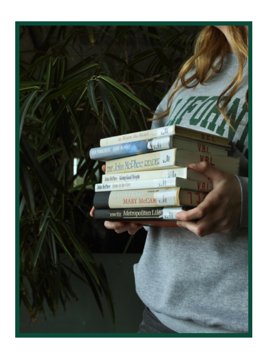
What does it cost me? Nothing! For students, ILLs are totally free.